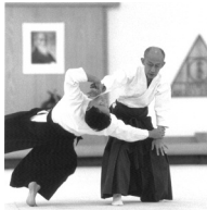
Nidai Doshu | Kisshomaru Ueshiba | 1921-1999