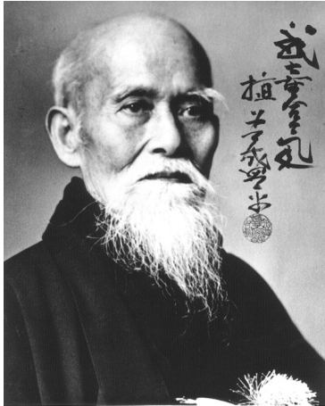
O-Sensei | Morihei Ueshiba | 1883-1969